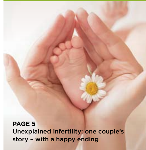
PAGE 5 Unexplained infertility: one couple's story – with a happy ending